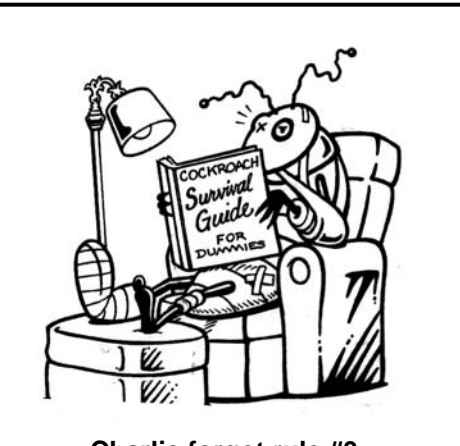
Charlie forgot rule #3: "ALWAYS STAY HIDDEN!"

Finally, this is a good time to check any sprinklers and make sure they are watering your plants only, and not the side of your home. When sprinkler water hits the side of your home it can increase the moisture content inside the wall, as well as under your home. Both situations can increase pest problems.